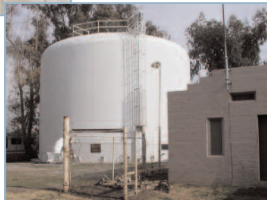
Stewart Intake Reservoir